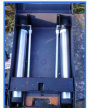
TYPICAL CIT APPLICATION SHOWING DYE DISCHARGE TUBES

These tubes have been successfully tested by the SABS (South African Bureau of Standards)